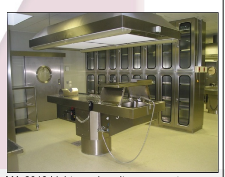
MA-2018 Light supply unit over an autopsy table