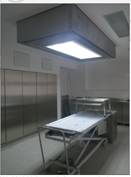
MA-2018 Light supply (square version)

VAT I.D No.: DE 257 930 159 Trade Register I.D No.: HRB 3402 Manufacturer I.D. No.: 21659