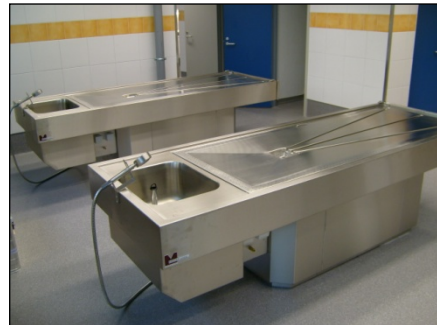
MA-0980 Standard Autopsy Table with square pedestal and concave embossed worktop

Incl. 3 m flexible hose with quench head