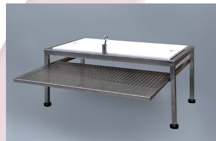
MA-0985 Organ table with grossing board, instrument tray and holder for shower