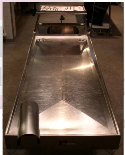
MA-0980 with positive (convex) embossed plain workplate and two drains. With sliding organ table