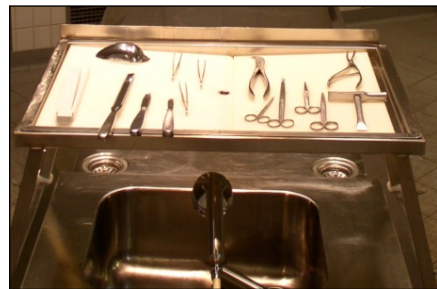
MA-0985 Sliding Organ Table