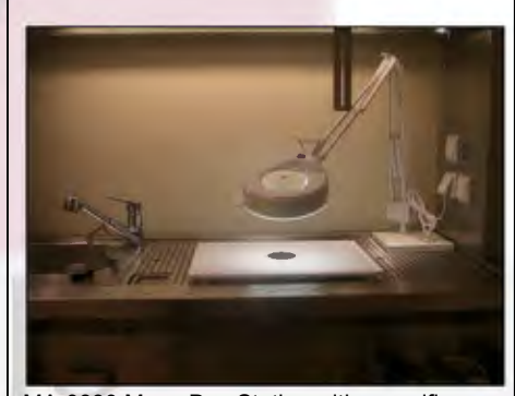
MA-0880 MacroDoc Station with magnifier lamp, grossing board with black orientation field and holder for camera