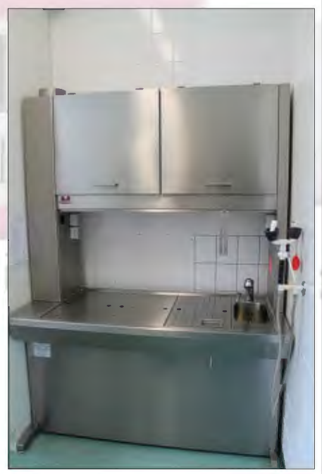
MA-0880 MacroDoc Station for wall position with superstructure and waste formalin collection system (customized small version)

Tel.: +49 6408 5035 – 0 Fax: +49 6408 5035 – 15 E-mail: <u>info@medisgmbh.com</u> Web: medisgmbh.com