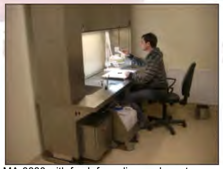
MA-0880 with fresh formalin supply system

Tel.: +49 6408 5035 – 0 Fax: +49 6408 5035 – 15 E-mail: <u>info@medisgmbh.com</u> Web: medisgmbh.com