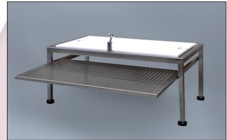
MA-0985 Organ table with grossing board, instrument tray and holder for shower