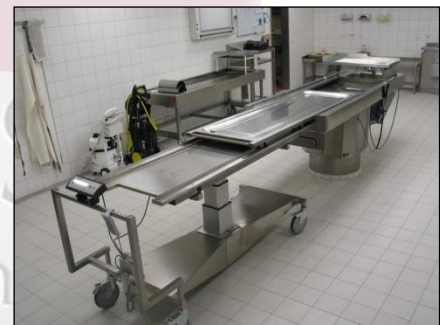
Body transfer procedure assisted by MA-2010 universal transporter