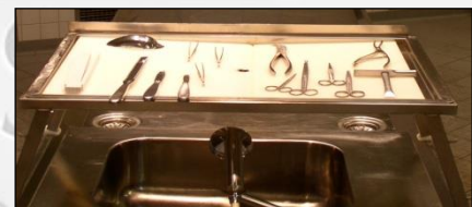
MA-0985 Organ Table