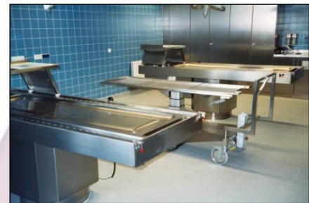
MA-2002 Autopsy Table with roll on / roll off work area (body tray) inserted

The pedestal also contains an integrated Standard Floor Extraction System (SFES) which picks up all fumes which are heavier than air directly from the floor into the in-house extraction system. The large investment in a floor extraction system build into the lower walls of the room is therefore no longer necessary.