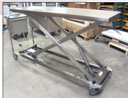
MA-1303 mounted to MA-1360 lifter