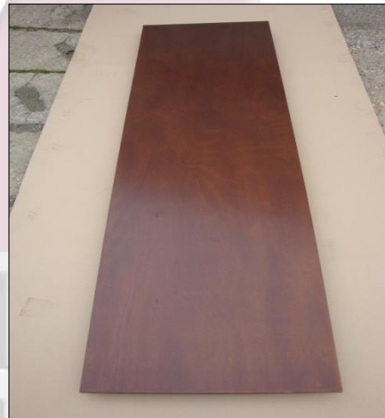
MA-1303 Transport plate (wood) with skids