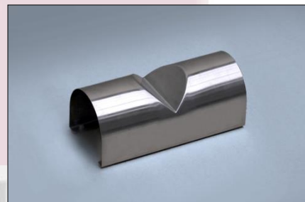
MA-0986 Stainless steel headrest with rubber Feet (also available in full rubber).