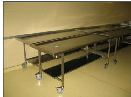
MA-0984 Autopsy table without sink, 4 feet and lockable castors. Incl. drain hole. Length: 2100mm