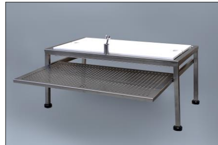
MA-0985 Organ grossing table with cutting board, instrument tray and holder for shower

Manufactured by MEDIS MT GmbH in Germany acc. to EN and German norms and the health & safety regulations of the EC and Germany!