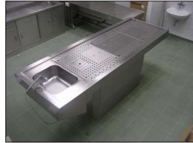
MA-0977 Autopsy Table with side wall downdraft extraction and height adjustment

Electronic height adjustment from 780 – 1080mm.