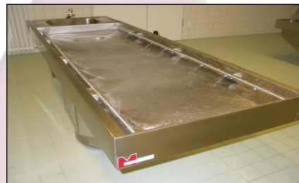
Option: rinse system below work area