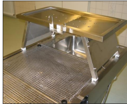
MA-0985 organ sectioning table (cutting board no shown).

On side-preparation and base plate sample as drilling template available.