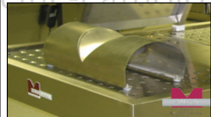
MA-0986 neck rest for adults