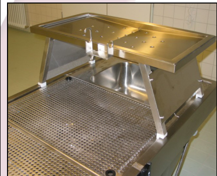
MA-0985 organ sectioning table (cutting board no shown).

Manufactured in Germany acc. to EN and DIN norms and valid health and work safety regulations.