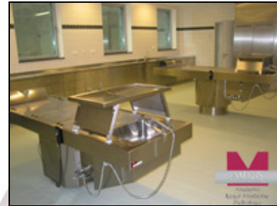
MA-0976 Autopsy Table with side-wall downdraft extraction and rotating worktop

Rotating worktop (2 x 45°) with quick lock device.