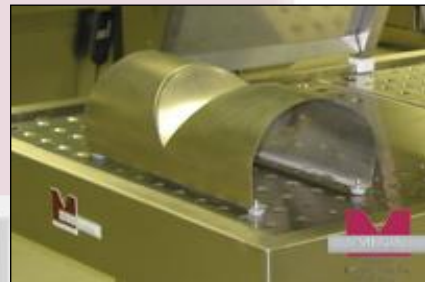
MA-0986 stainless steel neck rest for adults (also available in rubber)