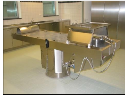
MA-0975 Autopsy Table with side wall downdraft extraction

2 x splash proof 230V receptacles and up / down switches on both sides of the pedestal for effective work cycle. The double slot wall extraction system avoids dirt and waste to enter the duct work and the inside of the pedestal.