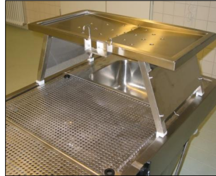
MA-0985 organ sectioning table (cutting board not shown).

Manufactured by MEDIS MT GmbH in Germany acc. to EN and German norms and the health & safety regulations of the EC and Germany!