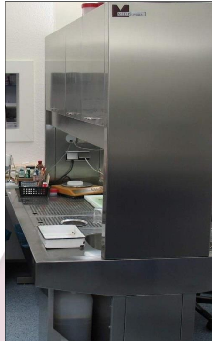
MA-0880 MacroDoc Station for wall position with superstructure for PC and camera