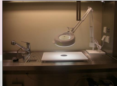
MA-0880 MacroDoc Station with magnifier lamp, grossing board with black orientation field and holder for camera