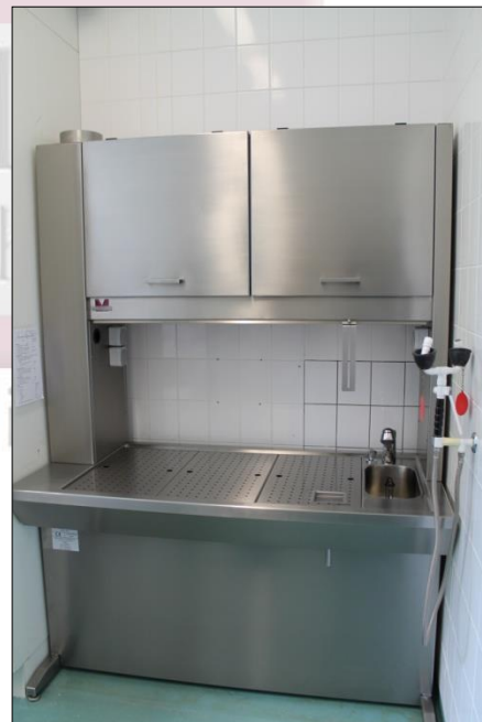
MA-0880 MacroDoc Station for wall position with superstructure and waste formalin collection system (customized small version)