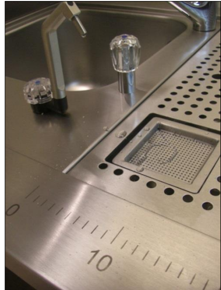
MacroDoc Station with formalin waste drain covered by a fine screen, fresh formalin dispenser and graduation

Manufactured by MEDIS MT GmbH in Germany acc. to EN and German norms and the health & safety regulations of the EC and Germany!