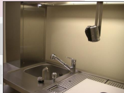
MA-0087 with illumination bridge, camera-holder, sink and duct channel towards ceiling (left)