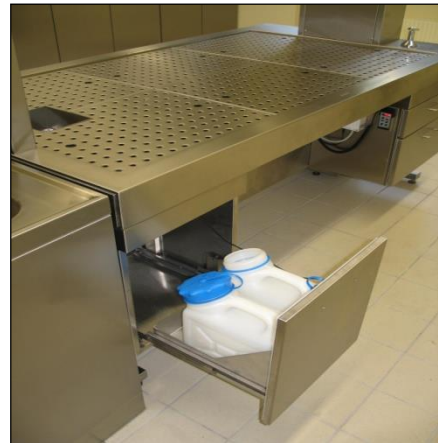
Integrated fresh formalin supply (option) and used formalin drain system

Manufactured by MEDIS MT GmbH in Germany acc. to EN and German norms and the safety regulations of the EC and Germany