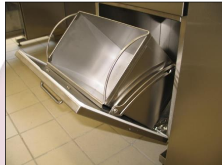
Integrated foot operated extracted waste bin