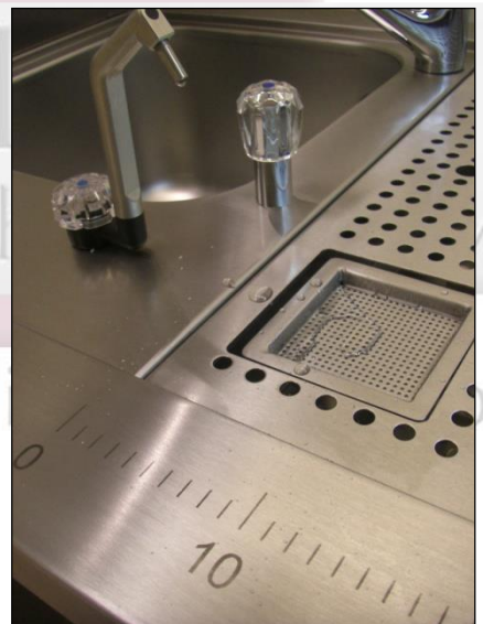
MacroDoc Station with formalin waste drain covered by a fine screen, fresh formalin dispenser and graduation