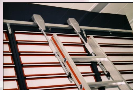
“HistoFile” system with special slide ladder