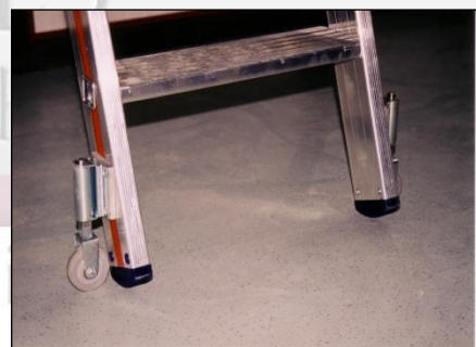
Special safety rollers of ladder with locks